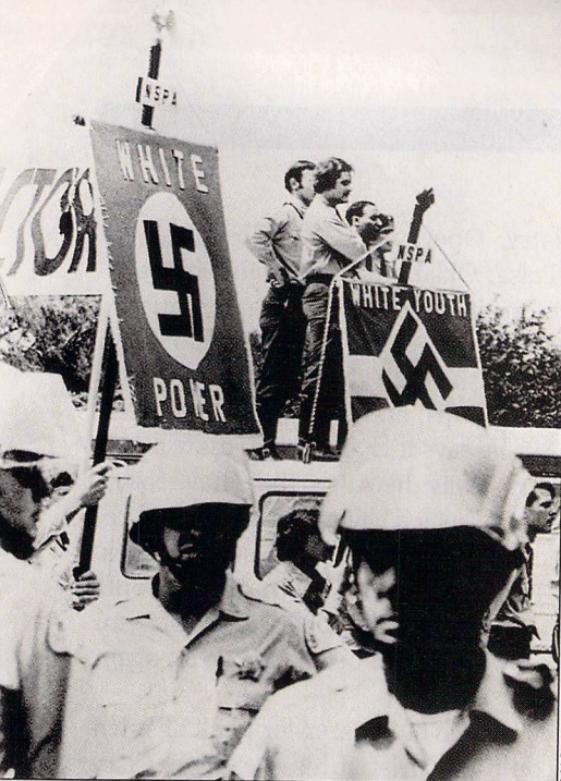
Nazi banners at a Southern pride rally

South Carolina has been slow to change. A black man was recently elected sheriff for the first time in my county's history, defeating a white incumbent by only a few votes. Whites charged fraud and appealed to the state election commission; blacks protested with charges of racism.