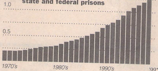
Total population in state and federal prisons